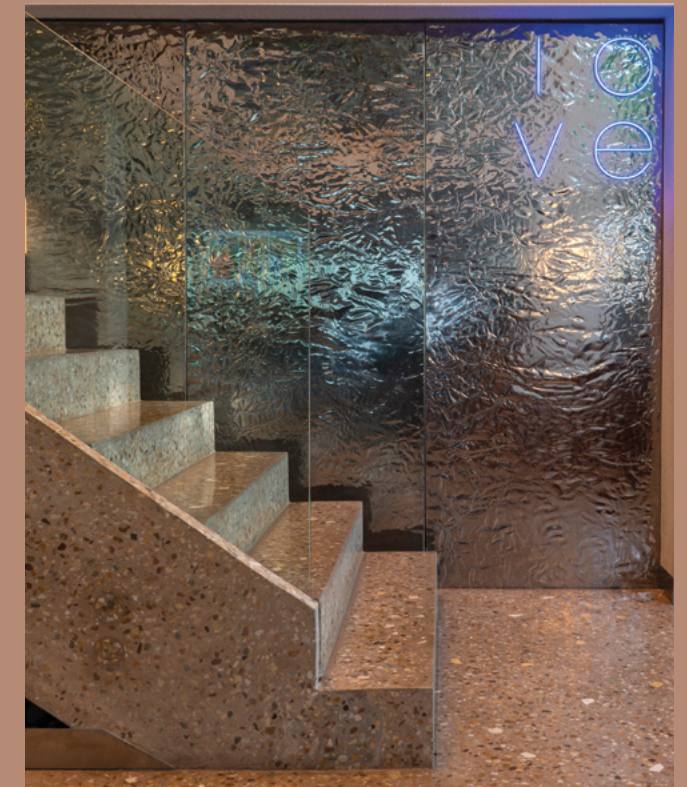
Location: Cape Town, South Africa IG: @espressolabza Espressolab De Waterkant

Located in Berlin's Hackescher Markt, Ben Rahim blends Middle Eastern coffee culture with the city's modern vibe. With sleek design and pleasant details, it's a relaxing escape from the hustle. Specializing in Arabic coffee and espresso, the café serves expertly crafted drinks in an inviting ambiance.