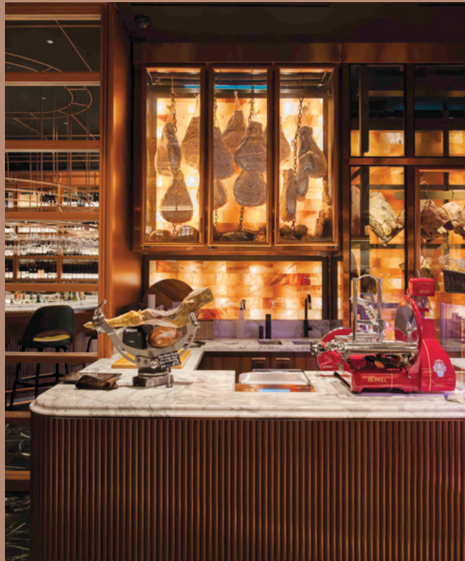
Location: Melbourne, Australia IG: @victorchurchillmelbourne Designer: Loopcreative

Victor Churchill Melbourne transforms butchery into an art form with a marble dining counter for a multisensory journey. The luxe interior features Verde marble floors and copper arches, reflecting Baroque influences. A horseshoe bar with a custom Modbar AV and Steam completes the space.