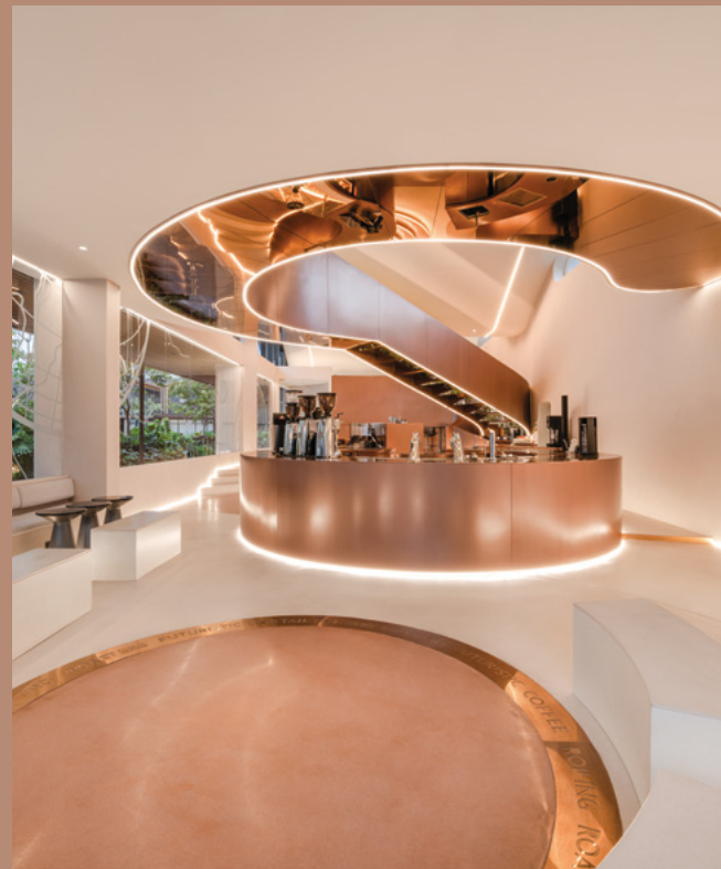
Location: Bangkok, Thailand IG: @rollingroasters.bkk Designer: TasteSpace Design

Victor Churchill Melbourne transforms butchery into an art form with a marble dining counter for a multisensory journey. The luxe interior features Verde marble floors and copper arches, reflecting Baroque influences. A horseshoe bar with a custom Modbar AV and Steam completes the space.