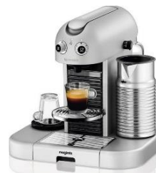
Gran maestria magimix