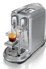
Creatista plus sage