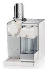
Lattissima touch delonghi