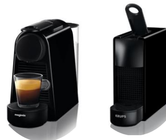
Essenza mini Krups/magimix