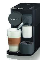
Lattissima one delonghi

*Nespresso® is a brand belonging to a third party which has no link with AluSense®.